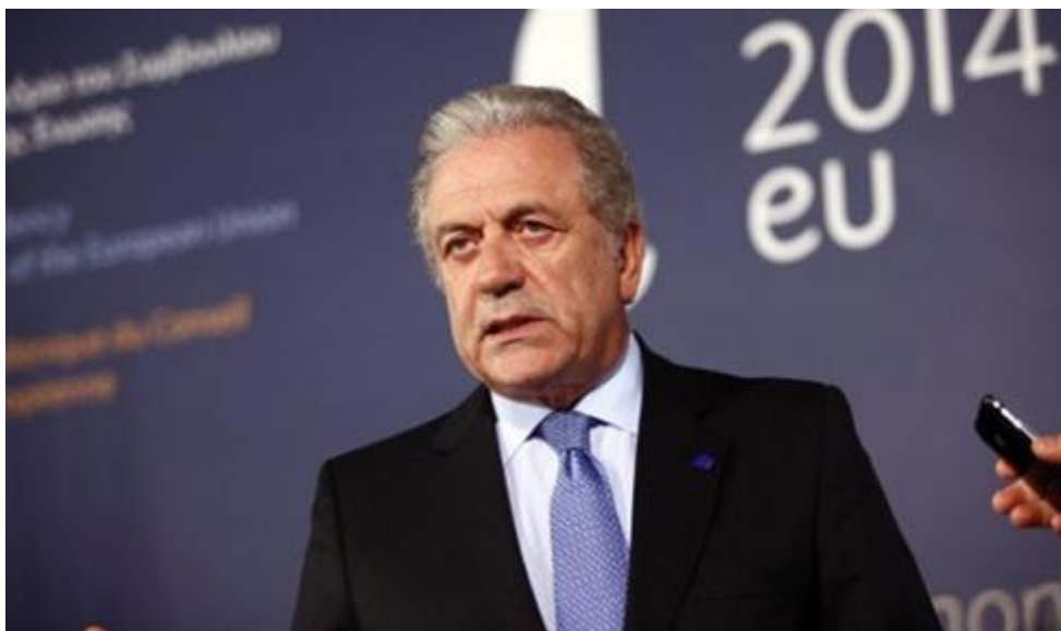
Facing a crisis: Dimitris Avramopoulos, Home Affairs Commissioner, visiting Kosovo this week

But there is also a different scenario, one where by 2017 the 105 million citizens of these countries are able to travel without a visa across the Schengen border, encouraging investment and tourism and reversing a decade long erosion of trust in the European Union; the total number of asylum applications from the A7 has fallen to below 10,000; and law enforcement institutions work closely with their counterparts in the EU to fight cross border crime and cooperate along the EU borders.