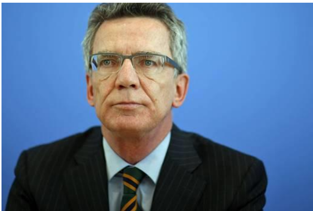
Thomas de Maiziere

"Interior Minister Skender Hyseni advocated for visa liberalisation for Kosovo. De Maiziere showed himself to be reluctant, noting that the number of Serbian asylum seekers increased strongly, after visas were lifted for Serbia" (Frankfurter Allgemeine Zeitung, 5. 3. 2015)