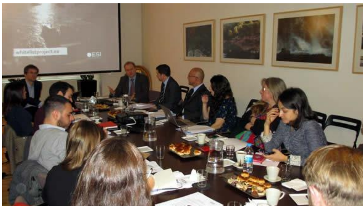
ESI Istanbul Visa Briefing with key EU Commission officials

On 16 December 2013, Turkey and the EU launched a visa liberalisation process. To qualify for visa-free travel Turkey has to improve border management, establish an asylum system complying with international standards, respect human rights and effectively fight illegal migration. All requirements are outlined in a visa roadmap .