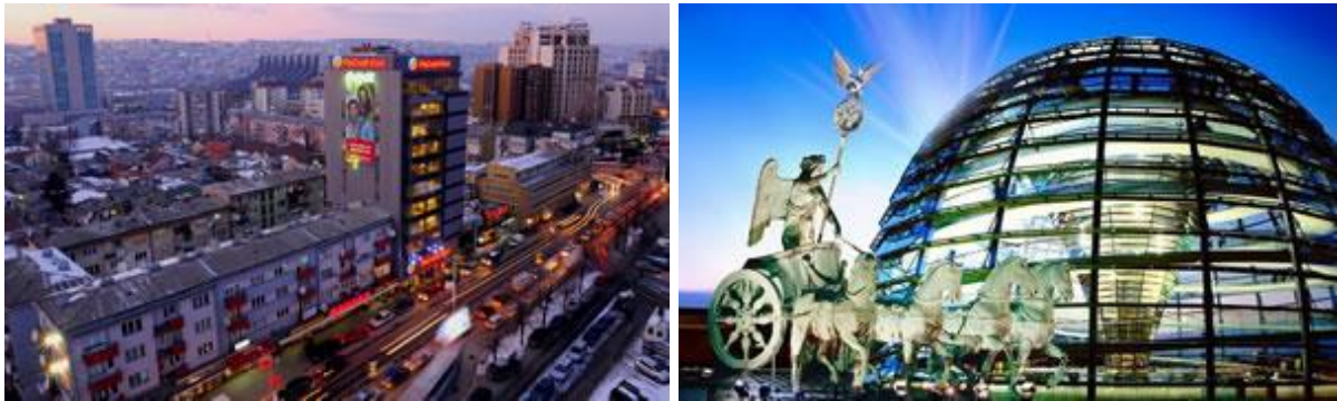
Pristina (Kosovo) – Berlin (Germany)