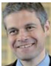
Laurent Wauquiez Minister for Higher Education and Research