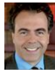
Luc Chatel Minister for National Education, Youth and Community Life