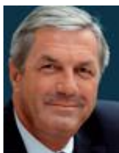
François Sauvadet Minister for Public Service