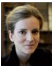
Nathalie Kosciusko-Morizet Minister for Ecology, Sustainable Development, Transport and Housing