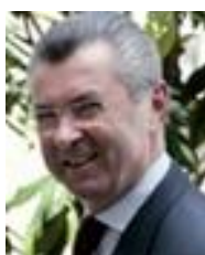
Henri de Raincourt Minister for Cooperation