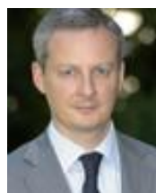
Bruno Le Maire