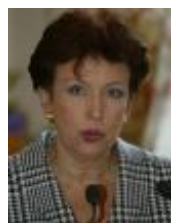
Roselyne Bachelot-Narquin Minister for Solidarity and Social Cohesion