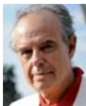
Frédéric Mitterrand Minister for Culture and Communication