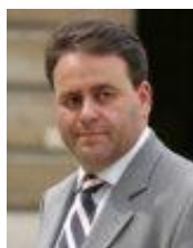
Xavier Bertrand Minister for Labour and Health