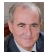
Maurice Leroy Minister for Urban Development