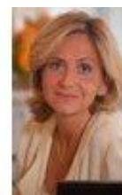
Valérie Pécresse Minister for Budget, Public Accounting and State reform