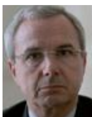
Jean Leonetti Minister for European Affairs