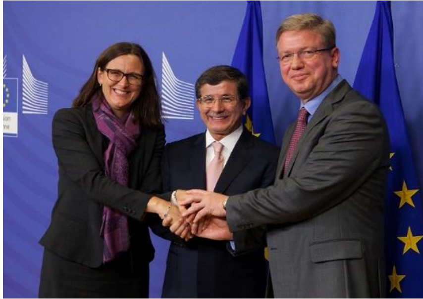
EU Home Affairs Commissioner Cecilia Malmstrom, Turkish Foreign Minister Ahmet Davutoglu and EU Enlargement Commissioner Stefan Fule agree to launch the visa liberalisation process, 4 Dec. 2013