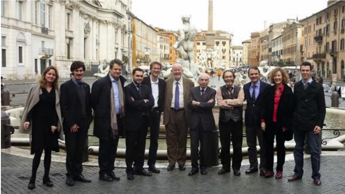
ESI White List Project Board meeting in Rome in January 2013 (Italians, Swedes, Germans, UK, Turks, Austrians and Moldovans in support of a strict but fair visa liberalisation process)

ESI has been working on the issue of visa liberalisation since 2006. For this we have created an advisory board including former interior ministers from across Europe ( Giuliano Amato , Otto Schily , Charles Clarke ) who provide us with guidance in this endeavour.