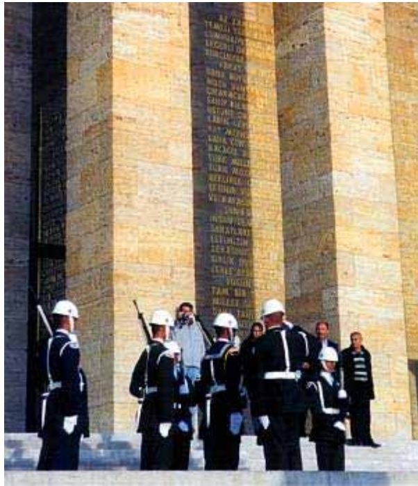
Ankara - Ataturk Mausoleum

2007 was a dramatic year for Turkish politics and society, even by the standards of a country used to political drama. However, few people would have expected 2008 to be even more volatile, and potentially catastrophic, for Turkish democracy.