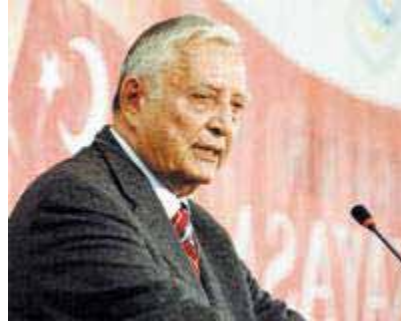
Ergun Ozbudun, constitutional expert

After this clear popular verdict, Turkey's political turmoil appeared to be at an end. The AKP had a comfortable majority in parliament. In August, the Government announced that work would begin on a new, so-called "civilian" constitution, based on the protection of individual rights rather than the statist ideology that had prevailed in the Turkish Republic since its founding. There had been widespread calls for constitutional reform from Turkish civil society, and of course from the EU.