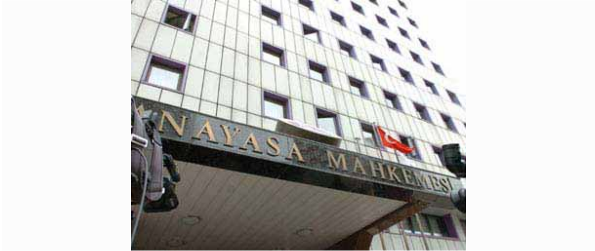
Anayasa Mahkemesi, Turkey's constitutional court