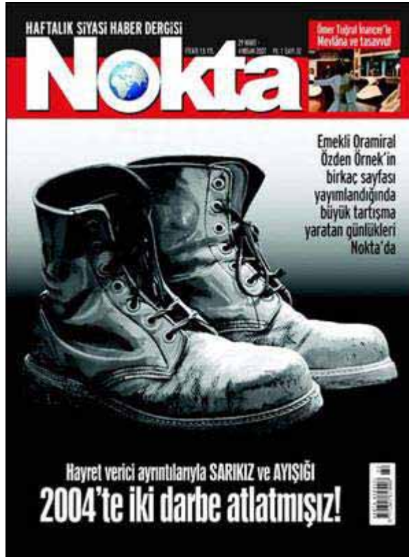
An issue of news magazine, Nokta

In March 2007, the current affairs weekly Nokta published a series of articles investigating the military's activities against the ruling AKP government.