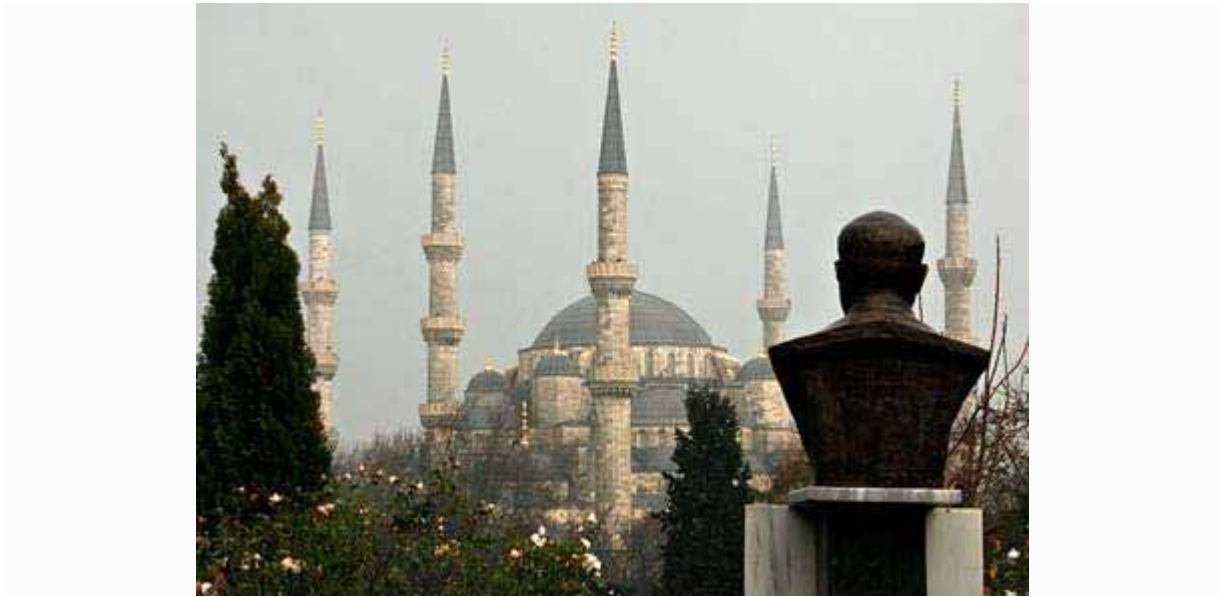
Bust of Ataturk and Blue Mosque in the background

On 31 March 2008 the 11-member Constitutional Court decided unanimously to hear the full case for the dissolution of the AKP. This is an ominous sign, and it leaves the Turkish government and Turkish supporters of European integration with a limited number of choices. But there still are choices and some are much better than others.