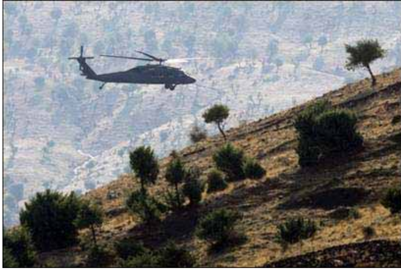
Turkish military helicopter

In October 2007, a series of terrorist attacks in the South East sent political tensions in Turkey to a dangerous level, dominating the political agenda and the news headlines.