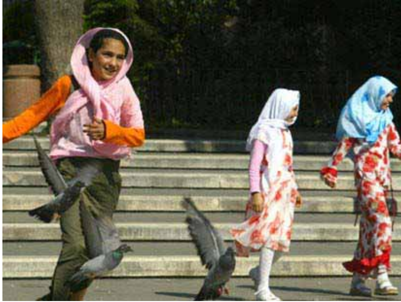
Girls in Istanbul

Following the 22 July 2007 elections and Abdullah Gul's election as president, the AKP prepared to amend the Constitution in a way that would enshrine freedom of dress at universities. This was easier said than done, as the legal situation in Turkey is far from clear. Banning students to enter university grounds wearing headscarves is a relatively new phenomenon. Until 1998, though with short-lived periods of restriction, girls could attend university with their headscarves.