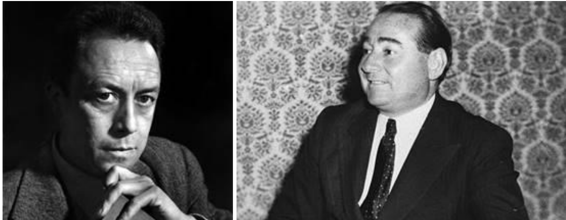
Opponent and victim of the death penalty (Albert Camus and Adnan Menderes)