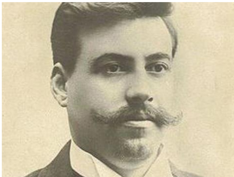
“Who am I?” – the next issue at EU Council meetings

“Achieving concrete results in the work of the Commission, verified by the Joint Intergovernmental Commission [ chaired by the two foreign ministers ] on the period of our common history up to 1944, including reaching agreement on Goce Delchev, VMORO-VMRO and the Ilinden-Preobrazhensky Uprising .”