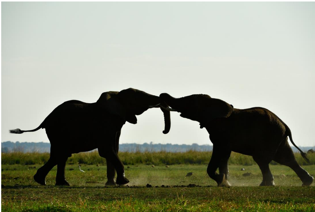
Two elephants in Skopje

And yet, by ignoring the obvious, von der Leyen resembled the man in Krylov’s tale: for Bulgaria, history remains the central condition for North Macedonia’s accession. With the French proposal von der Leyen recommended, history was about to become a condition for the whole EU.