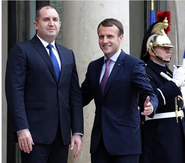
Two presidents: Rumen Radev and Emmanuel Macron