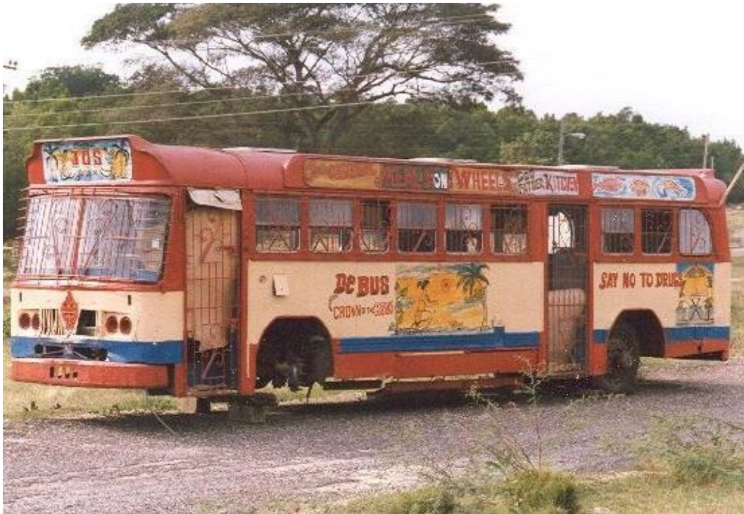
The state of the EU accession process today

Far from North Macedonia being an outlier, all Western Balkan states are stuck. Their accession process resembles a bus without wheels, with North Macedonia discussing conditions for moving up a row of seats inside a vehicle going nowhere.