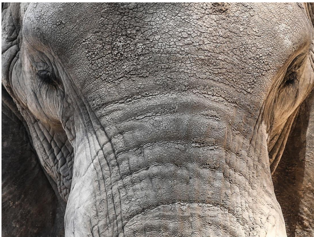
In parliament in Skopje yesterday

“But did you see the elephant? What did you think it looked like?”