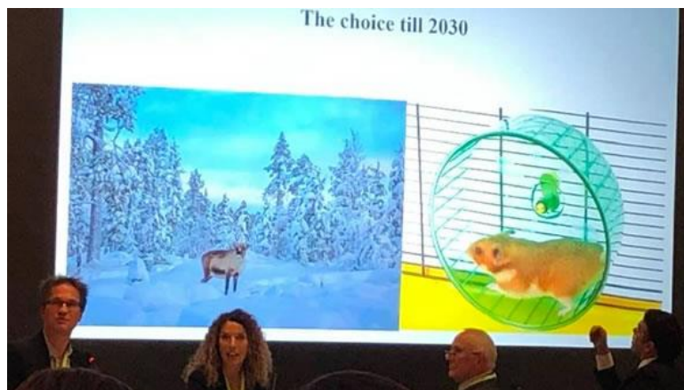
Presentation of ESI "Finnish road" proposal in Berlin in December 2019