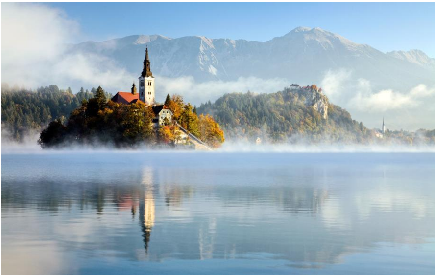
How the Slovenian presidency can revive EU-Balkan policy