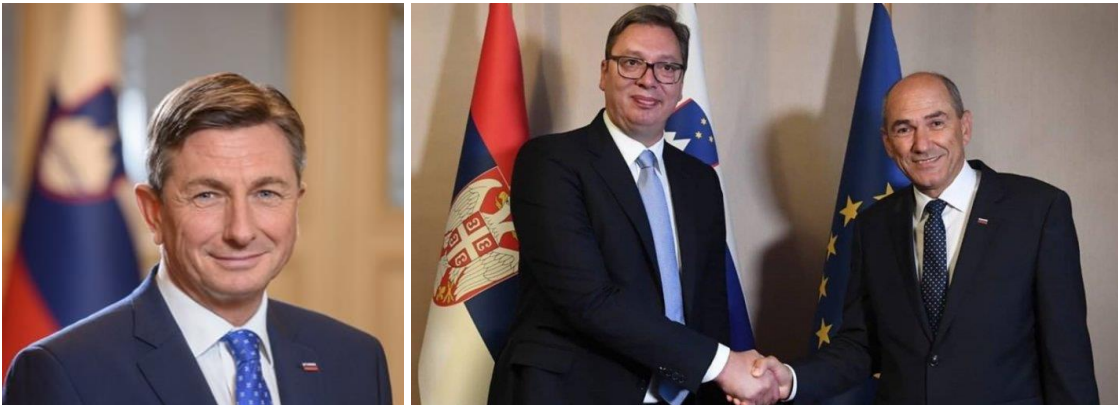
Presidents Borut Pahor and Aleksandar Vucic – prime minister Janez Jansa

In 2008 a previous Slovenian EU presidency played a pivotal role brokering a compromise to get to a meritocratic visa liberalisation process for the Western Balkans. This ended years of frustration and division on the issue within the EU and led to all Western Balkan citizens (except those from Kosovo) to be able to travel visa free to the EU by the end of 2010. It was a major success of Slovenian diplomacy.