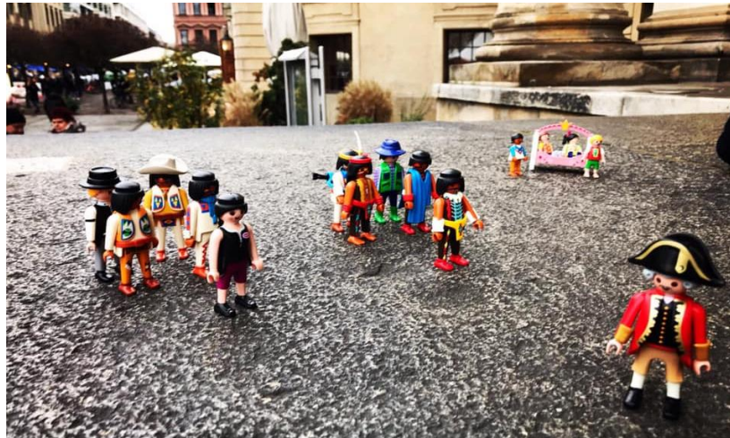
Motivation matters: question of a child and the role of civil servants (8 December 2019)

It took Romania from February 2000 to December 2004 to complete its accession talks with the European Union. Serbia, which started accession talks in 2014, should certainly be able to complete the required reforms to join the EU Single Market within a few years. So should Montenegro, North Macedonia and all other Western Balkan countries willing to focus on this as their national policy priority in the coming years.