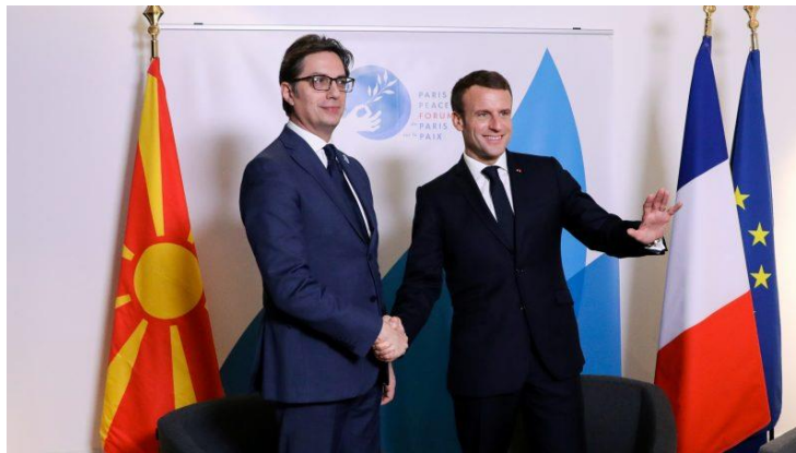
ESI Interview on Alfa TV – February 2021: Why the Finish road to accession proposal is good for North Macedonia