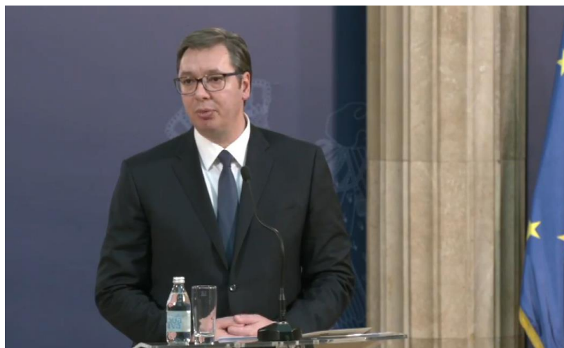
Alexander Vucic in Belgrade – 31 January 2020 (in Serbian): "Predsednik Vucic i Borel se obracaju medijima"

In 1989 governments in Finland, Sweden and Austria concluded that Delors' offer was in their national interest. Without this interest the EEA would never have been created. The question in 2021 is whether a similar offer on the part of the EU could be replicated and whether that would be in the interest of the Western Balkan countries: Would they accept it?