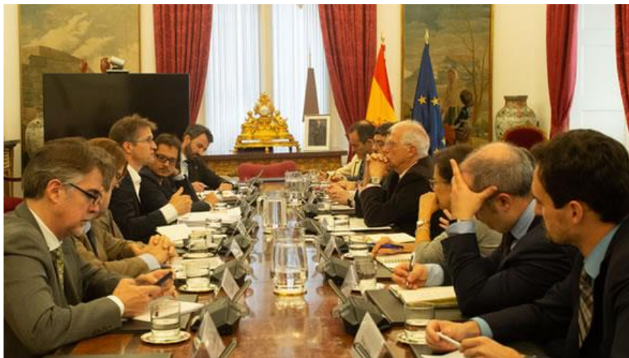
Presentation of ESI Finland proposal in Madrid – November 2019

Neue Zürcher Zeitung, Andreas Ernst, " Macron sagt nicht nur Nein – der französische Vorschlag für die Erweiterung der EU " ("Macron doesn't just say no – the French proposal for EU enlargement") (21 November 2019)