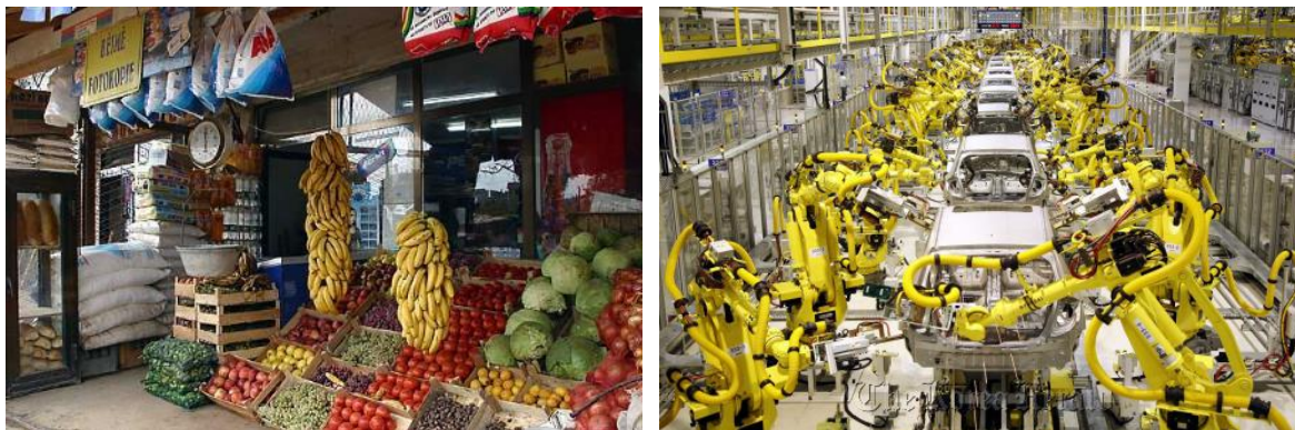
Business climates – Balkania vs. Danubia