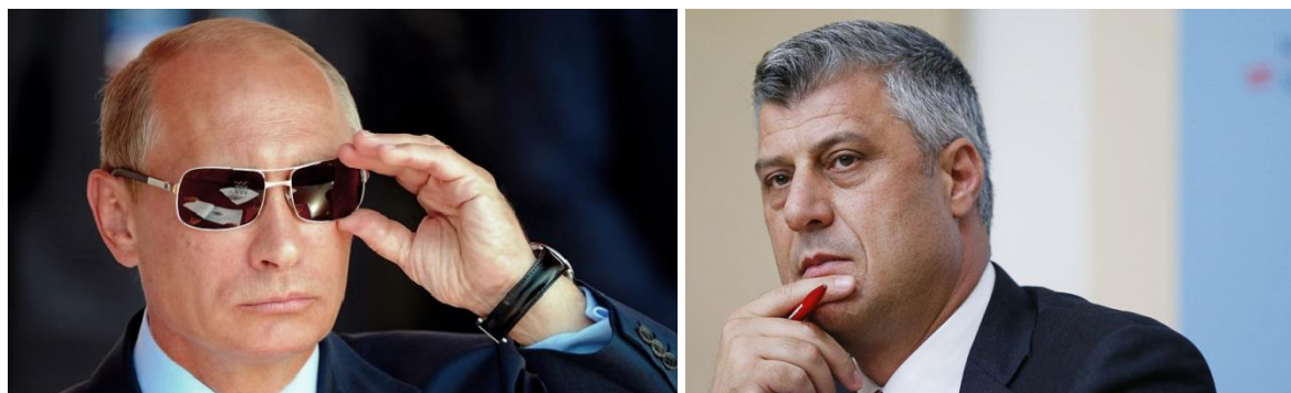
The next outliers? Putin and Thaci

The report explains that "data points may be revised as new information is available, which is also applied to the time series to ensure consistency of data." And yet these corrections are curious. Will there be more dramatic corrections next year? Could it be that in reality, following further revisions, some of the most surprising success stories will turn out to be illusions?