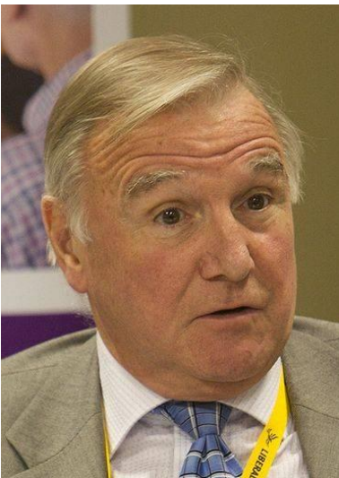
Malcolm Bruce (United Kingdom) Rapporteur for Political Prisoners 2003-2005 Liberal Democrat