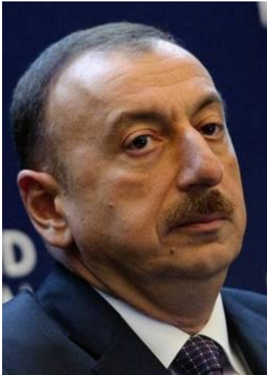
Ilham Aliyev (Azerbaijani) President (2003 till today) Head of Delegation to PACE (2001-2003)