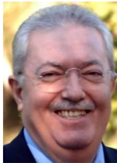
Pedro Agramunt (Spanish) Rapporteur of the Monitoring Committee since 2010 Conservative