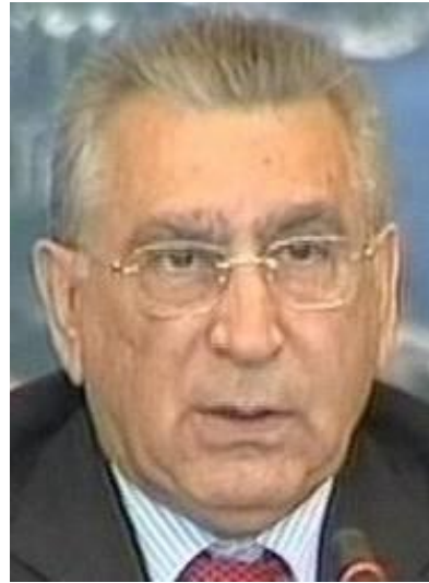
Ramiz Mehdiyev (Azerbaijani) Head of Presidential Administration