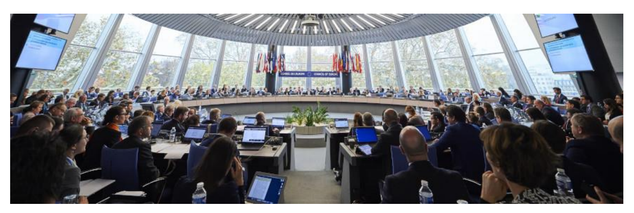
Ambassadors in the Committee of Ministers in Strasbourg

On 24 January this year, the Parliamentay Assembly of the Council of Europe (PACE) voted overwhelmingly to suspend the Azerbaijani delegation from the Assembly. So far, the Committee of Ministers of the Council of Europe has not responded either to PACE's decision, or to the dramatic deterioration of human rights that prompted it.