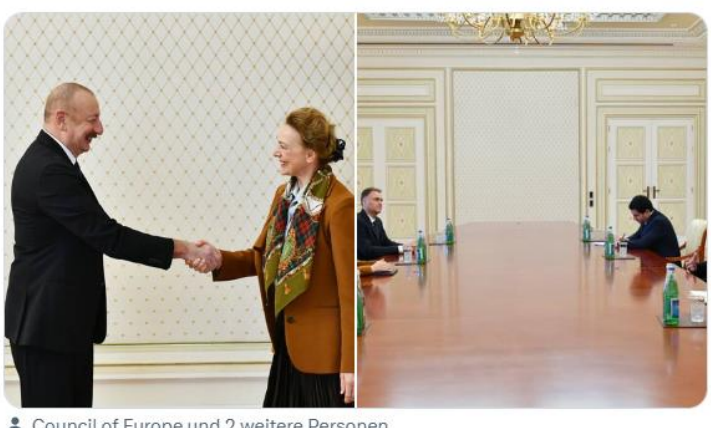
Council of Europe und 2 weitere Personen 3:21 nachm. • 8. Dez. 2023 • 24.582 Mal angezeigt