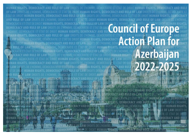
A document of deception

The new Action Plan has been prepared by her staff, including the office of the Council of Europe in Baku, and the authorities in Baku. The budget of \notin 9.6 million will be raised by the Council of Europe.<sup>23</sup>