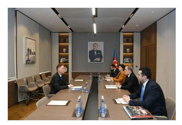
Petr with Foreign Minister in Baku

position under PACE presidents Mevlüt Çavuşoğlu<sup>41</sup> and Jean Claude Mignon.<sup>42</sup> In 2013, he is appointed to head the Council of Europe Office in Russia.<sup>43</sup>