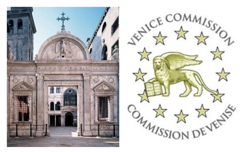
Scuola Grande di San Giovanni Evangelista, Venice – Emblem

On 20 June 2022, the Venice Commission opinion on the Media Law is published. This is its most harsh assessment on this issue ever.<sup>27</sup> It concludes that key provisions of the Media Law "are not in line with European standards on freedom of expression and media freedom": "the Law should not be implemented as it stands."<sup>28</sup> Among provisions which do not meet the requirements of the ECHR are: