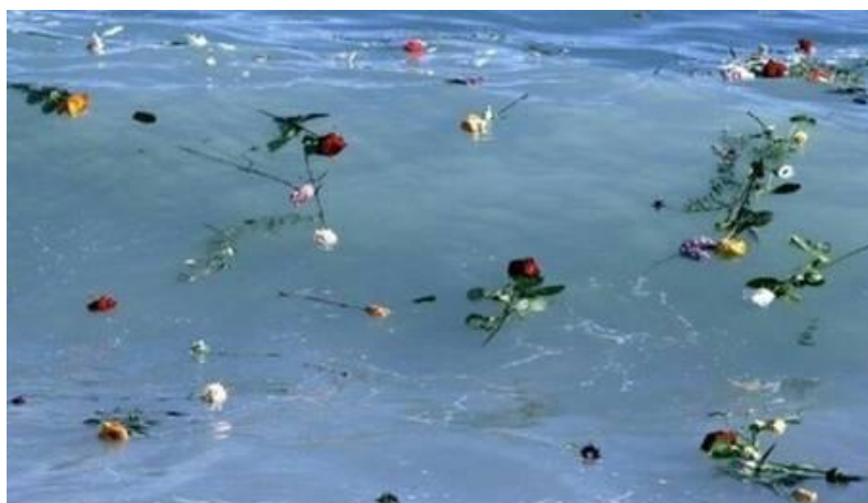
More than 800 die in one shipwreck - April 2015

Four years and more than 12,000 deaths by drowning in the Central Mediterranean later — four times the number of victims of the conflict in Northern Ireland — the EU is no closer to a workable strategy.