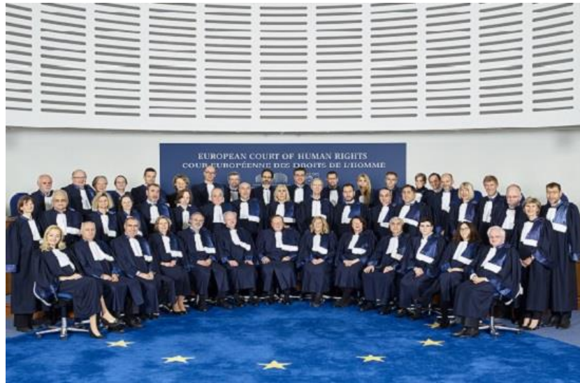
A court that matters

The European Court of Human Rights (ECtHR) is one of the leading human rights institutions in the world. Since 1959 it has issued nearly 20,000 judgements . It has ruled on landmark cases defending the basic rights set out in the European Convention of Human Rights. As a bulwark against any return to autocracy it is also, in an age of rising illiberalism, a target.