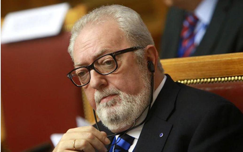
Agramunt's fall – the end of an era

European citizens need a credible ECtHR to defend their rights, now more than ever. The ECtHR needs a credible PACE. The fight for the credibility of the assembly, led by a coalition of concerned MPs, has been one of the most surprising stories of 2017.