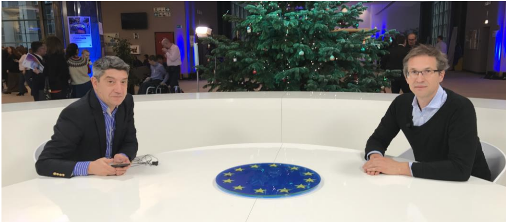
Presentation of ESI Macedonia name proposal in Brussels (here in English) 2017