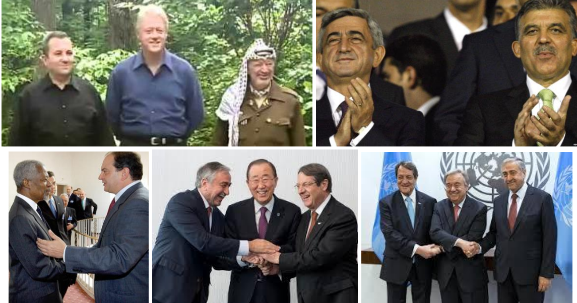
Gallery of failure

The list of leaders who tried to resolve deep conflicts and fell dramatically short in the end is long. Recent additions to the gallery of diplomatic failure include Ehud Barak and Yasser Arafat (2000); governments in Yerevan and Ankara (2009); successions of leaders in Athens, Ankara, and Nicosia (2004, 2017).