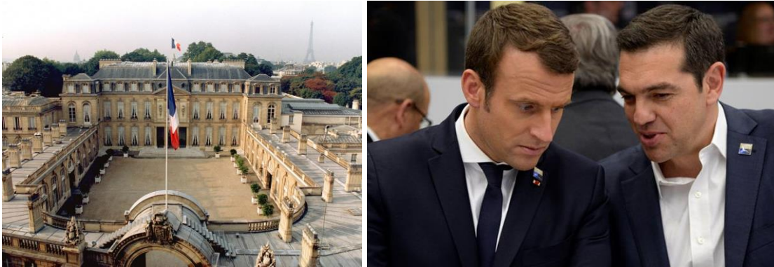
French inspiration for South East Europe?

At the same time both sides adopt a joint declaration on other steps they will take to build confidence and create trust. Such a declaration may also be ratified as an agreement in either (Skopje) or both parliaments, though this is less important than its serious implementation. It should aim to be a document making history; aimed at both future governments and at citizens of both societies. It should be concrete. It need not be long.