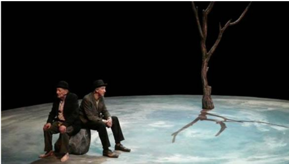
Finally, the waiting ends?

2017 Brussels – 2017 Berlin – 2017 Skopje