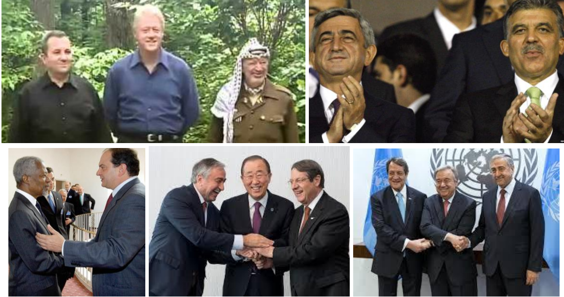
Gallery of failure

The list of leaders who tried to resolve deep conflicts and fell dramatically short in the end is long. Recent additions to the gallery of diplomatic failure include Ehud Barak and Yasser Arafat (2000); governments in Yerevan and Ankara (2009); successions of leaders in Athens, Ankara, and Nicosia (2004, 2017).