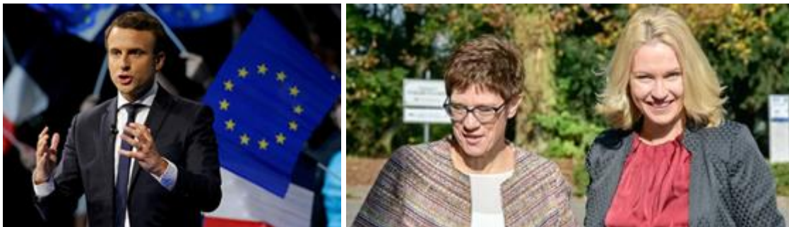
Emmanuel Macron, Annegret Kramp-Karrenbauer (CDU) and Manuela Schwesig (SPD)

In September 2017 French president Emmanuel Macron made a passionate plea for a "Europe that protects" at Sorbonne University . There he argued that the EU needed to be able to