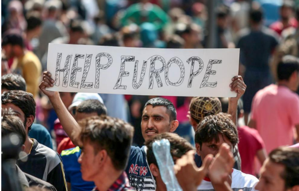
Refugees in Budapest in September 2015