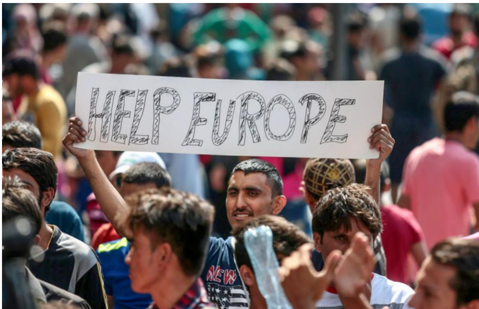
Refugees in Budapest in September 2015