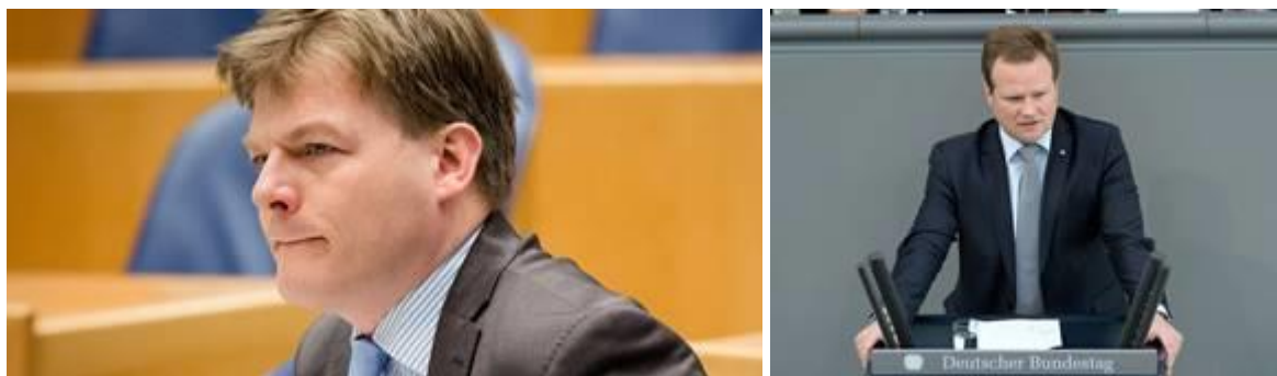
Pieter Omtzigt (from the Netherlands) – Frank Schwabe (from Germany)

On Wednesday 25 January, a group of MPs led by Dutch MP Pieter Omtzigt (EPP) and German MP Frank Schwabe (SPD) submitted a strong declaration as a game changer . On the one hand, they called on PACE to do two concrete things; on the other hand, they called on all members from across political party groups to support this call: