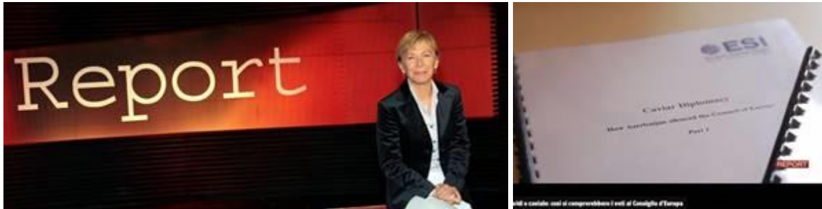
Rai 3 investigation – Caviar Diplomacy