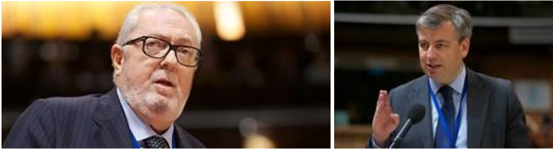
Pedro Agramunt and Jordi Xucla: on PACE, corruption and honour

Faced with demands from all sides for a serious reaction the president of PACE, Pedro Agramunt, a leading apologist of the regime in Azerbaijan for more than a decade, decided to continue to do what he had done for years: to call on PACE to close ranks. He set the tone on the first day, defining the debate on corruption as a matter of "honour":