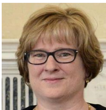
Irish High Court judge Aileen Donnelly