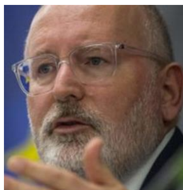
Commission Vice-president Frans Timmermans