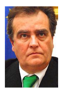
Roberto Calderoli Minister of Streamlining