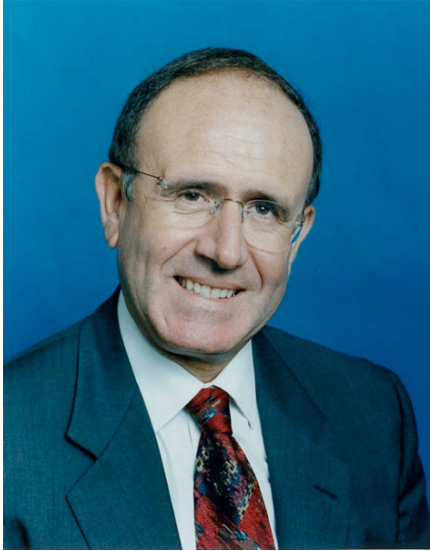
Pino Arlacchi (Italy) Head of the European Parliament delegation Social Democrat