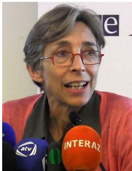
Tana de Zulueta (Italy) Head of the OSCE/ODIHR delegation