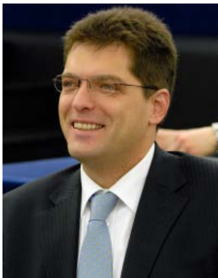
Janez Lenarcic (Slovenia) ODIHR Director