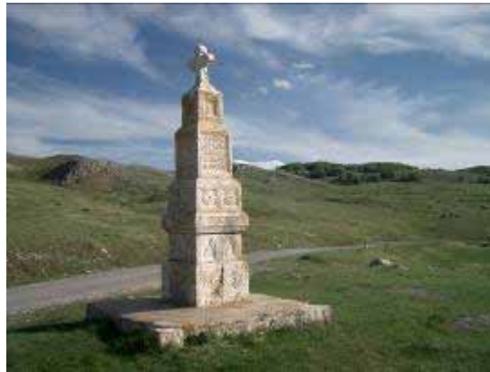
On the Zabljak mountain plain

Leaving Podgorica heading north one enters a rather different world. A majority of the Orthodox population here sees itself as ethnically Serb, not Montenegrin.