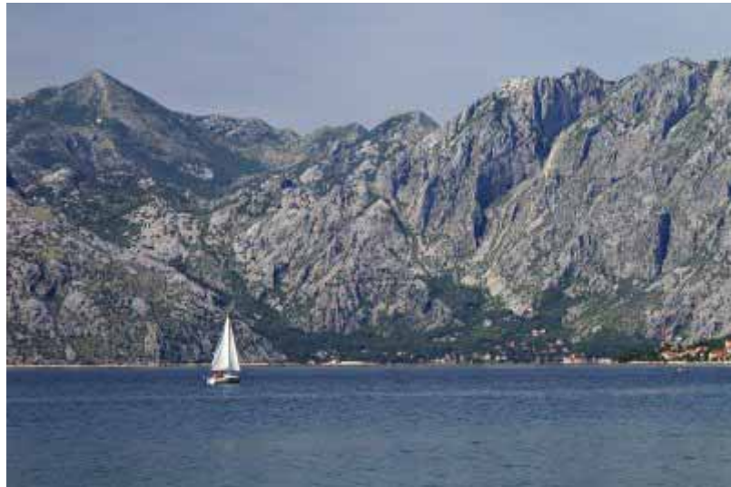
The bay of Kotor

What one can clearly see in Kotor and along the rest of the coast is how much Montenegrin economic growth is being driven by tourism. Tourism in turn boosts services and construction. According to the Ministry of Ministry of Tourism and Environmental protection, tourism generated EUR 322 million of revenues in 2006, 23.5 percent more than in 2005.