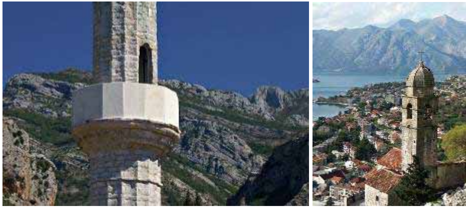
Minaret in Stari Bar – Church overlooking Kotor

In his 1993 essay on the “clash of civilisations” Samuel Huntington sought to explain (among other things) the roots of violent conflict in the Balkans: