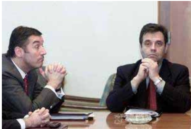
Montenegro's Milo Djukanovic and Serbia's Kostunica looking glum

The fall of Milosevic did not solve the problems of the dysfunctional Yugoslav federation. Federal president Vojislav Kostunica, Montenegrin president Milo Djukanovic and Serbian prime minister Zoran Djindjic concluded on 26 October 2001 that the positions of Belgrade and Podgorica were irreconcilable. “We have tried today to bring our two positions closer, and we concluded that this is not possible”, Kostunica announced, adding that “the Montenegrin public should vote on the issue in a referendum”.