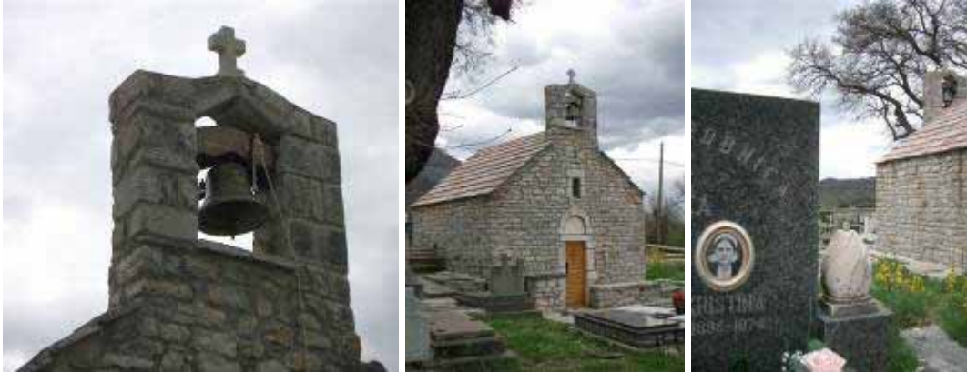
The Church of St. Tekla in Sutomore, hosting both a catholic and an orthodox altar

Not far from Bar, close to Sutomore, one finds the church of St. Tekla. The small church has two altars, one Catholic, the other Orthodox.