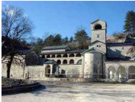
Cetinje Monastery, former seat of Montenegrin rulers, current seat of Serbian Orthodox bishop

The Serbian Orthodox bishop's seat is in the Cetinje Monastery that has been the seat of Montenegrin rulers until the 19 th century. However, in 1993 a "Montenegrin Orthodox Church" was founded, claiming to be the rightful successor to the Church that was merged into the Serbian Orthodox Church after Montenegro's incorporation into Serbia following the First World War.