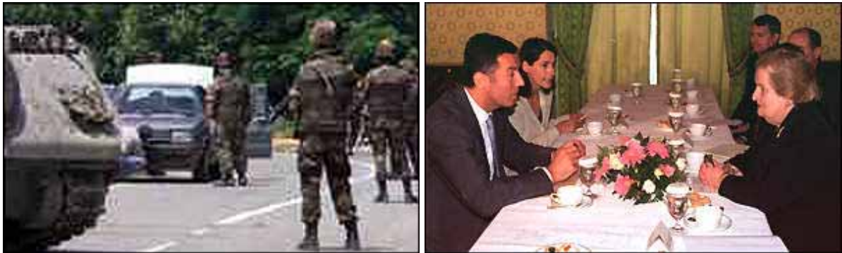
Yugoslav Army roadblock in Montenegro in 1999 – Djukanovic with US Secretary of State Madeleine Albright in 2000

From that moment Milosevic excluded the Montenegrin government from all meaningful participation in the institutions of the Federal Republic of Yugoslavia (FRY).