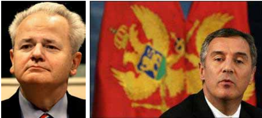
Slobodan Milosevic - Milo Djukanovic

The turning point in recent Montenegrin history came in 1997, when Montenegro's young prime minister Milo Djukanovic, in power since 1990, distanced himself from Slobodan Milosevic and, in late 1997, defeated his former ally, Milosevic-backed Momir Bulatovic, in presidential elections.