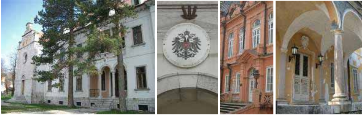
The Austrian Delegation – details of the Austrian, Russian and Italian Delegations

Cetinje, the former capital, has always been central to the idea of Montenegrin statehood. After the Ottoman conquest of the Balkans only a small area around Cetinje was governed by a Montenegrin prince-bishop. While Montenegrin rulers in Cetinje maintained that Montenegro was independent, the Ottomans insisted that it was an integral part of their Empire. In any case, after Napoleon abolished the Republic of Dubrovnik in 1810, Montenegro claimed that it was the only Balkan polity that continued to enjoy de facto independence.