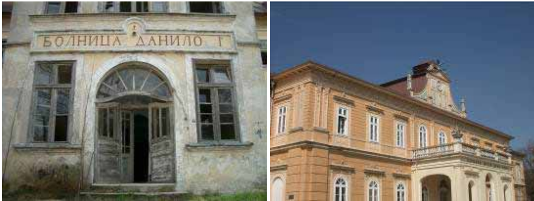
Old hospital – the old government building

A stroll through Cetinje today shows the former consulates that are reminders of this state tradition. There is the old hospital (fallen into decay), King Nikola's Palace, and the old government building.