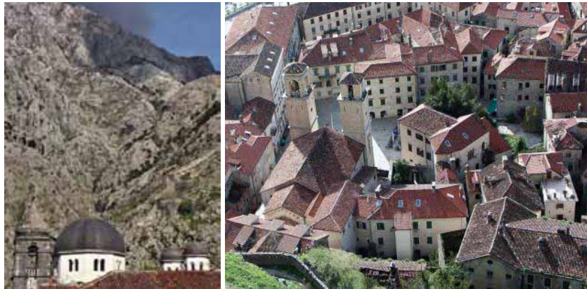
Catholic and Orthodox Church in Kotor – view on St Tryphon's Cathedral

In the small Adriatic town of Kotor one also finds signs of coexistence of the Catholic and Orthodox faiths. Traditionally here in mixed marriages partners keep their respective faith. In earlier times there existed the habit to baptise the sons according to the faith of the father and the daughters according to the faith of the mother. Godfathers and best men are still often of different confession than those who marry. Although many Catholics emigrated in the past century the town still hosts a sizeable catholic population (12 percent).