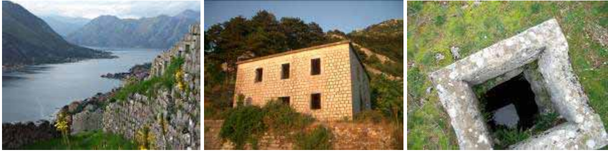
St. Ivan's fortress above Kotor – the former border checkpoint operated by Austro-Hungary – water reservoir at the checkpoint

Montenegro in its current form took shape only after the Balkan wars of 1912-1913. While it had expanded in the previous centuries, parts in the North belonged still to the Ottoman Empire and the Northern part of the Coast was part of Austria-Hungary.