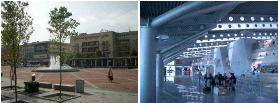
Central Podgorica –the new airport

Let us begin our journey in the city the “Lonely Planet” calls “Montenegro’s most unattractive spot”: its capital Podgorica. The description is a bit unfair: in fact, economic growth and investments are transforming the youngest European capital.