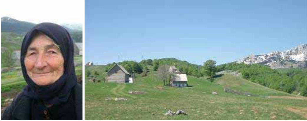
Rada Tomcic in the village “Mala Crna Gora” – Plain around Zabljak

Some 20 km from Zabljak one reaches the small village of Mala Crna Gora ( little Montenegro ). It is inhabited by some 70, mostly elderly, people. The village is so remote that allegedly Ottoman forces never entered it. With the first snow, the mountain road becomes impassable. Depending on the ferocity of the weather the village cannot be reached for four to six months in winter.