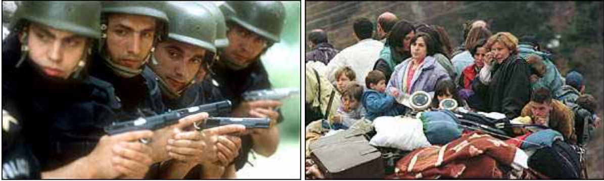
Montenegrin special police, Kosovo refugees at the Montenegrin border

The most dangerous moment in the cold war between Serbia and Montenegro came with the 1999 Kosovo war and its aftermath. The Montenegrin government had declared itself to be neutral in the conflict. It had also given sanctuary to some 40,000 Kosovo Albanian refugees. This put Montenegro on the side of the West against Milosevic's Serbia.