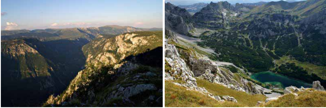
Tara Canyon – Skrcko Jezero

When the Ottomans conquered the medieval Balkan states in the 14 th and 15 th centuries, they made little effort to control these remote and poverty-stricken mountain lands of Montenegro.