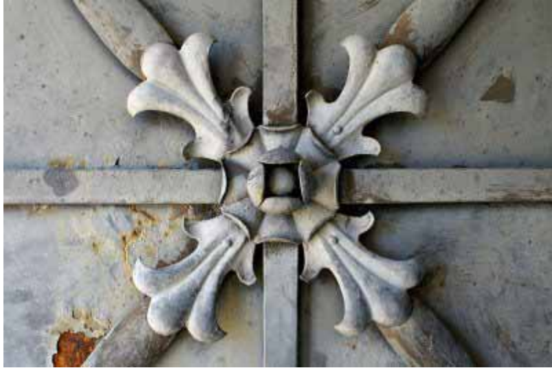
Church door in Stari Bar (old Bar)

The city of Bar on the Adriatic is a good place to examine local traditions of inter-ethnic and multi-confessional co-existence. Bar hosts the country's most diverse population.