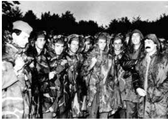
Milo Djukanovic and Momir Bulatovic with Montenegrin soldiers in 1991

In 1991 it looked as if Samuel Huntington was right: Orthodox Montenegrins participated in the shelling of Catholic Dubrovnik. Orthodox Montenegrin police officers deported Muslims who had fled to Montenegro to be killed by Bosnian Serbs.