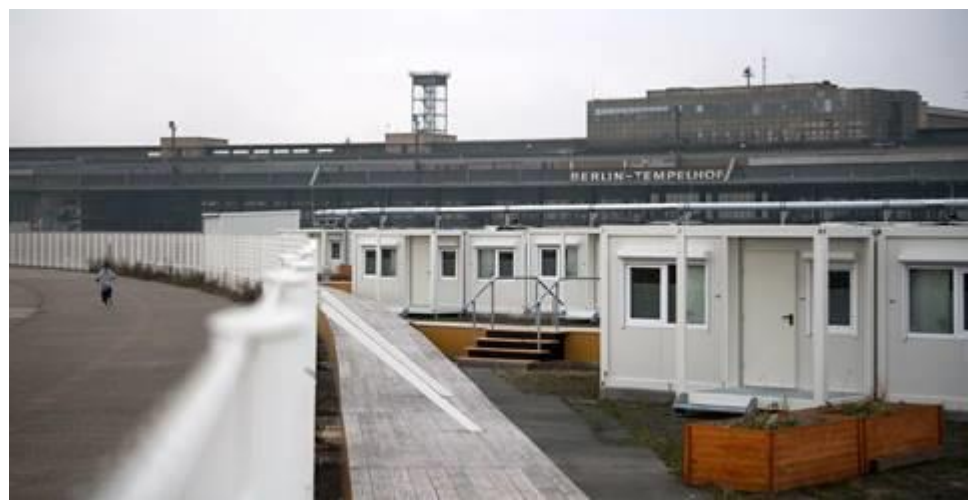
Berlin Tempelhof – where space is available

And yet: even under pressure and in a crisis, there is room for empathy. North Rhine Westphalia and other German states opened intensive care units for infected patients from France and Italy. The government of the state of Berlin recently offered to relocate up to 1,500 people from Greece to Germany. If five of the sixteen states in Germany would each offer to accept 1,000 recognised refugees from the Greek mainland this alone would free 5,000 places for families with children now on the islands. If other countries would join in, 10,000 recognised refugees might easily be relocated even now.