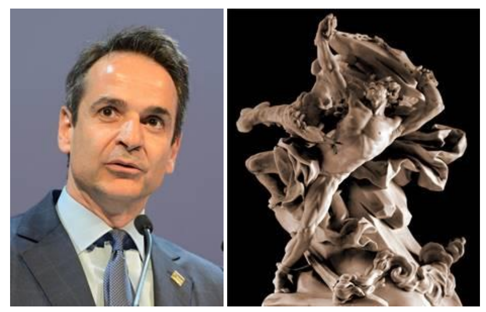
Mitsotakis – Politics at the time of corona

What will the Greek government do? The two policy options it has correspond to two scenarios.