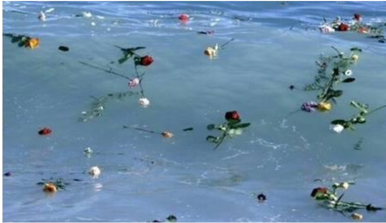
More than 800 die in one shipwreck - April 2015

Four years and more than 12,000 deaths by drowning in the Central Mediterranean later — four times the number of victims of the conflict in Northern Ireland — the EU is no closer to a workable strategy.