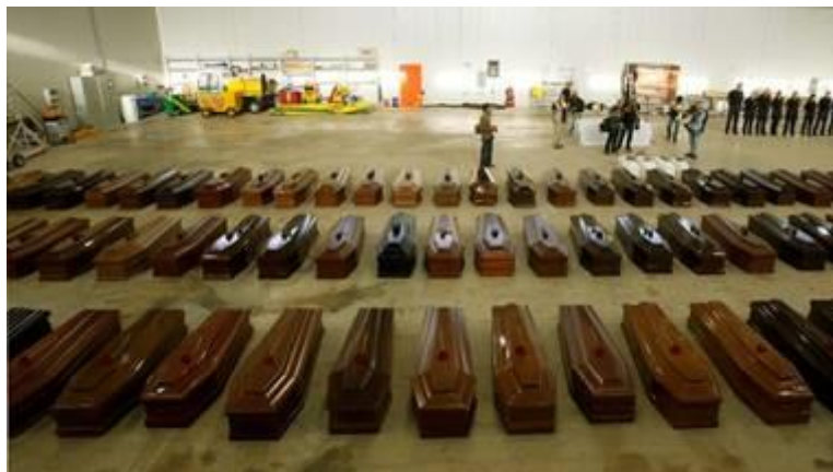
Lampedusa in October 2013

(Brussels Convention on assistance at sea, adopted in 1910)