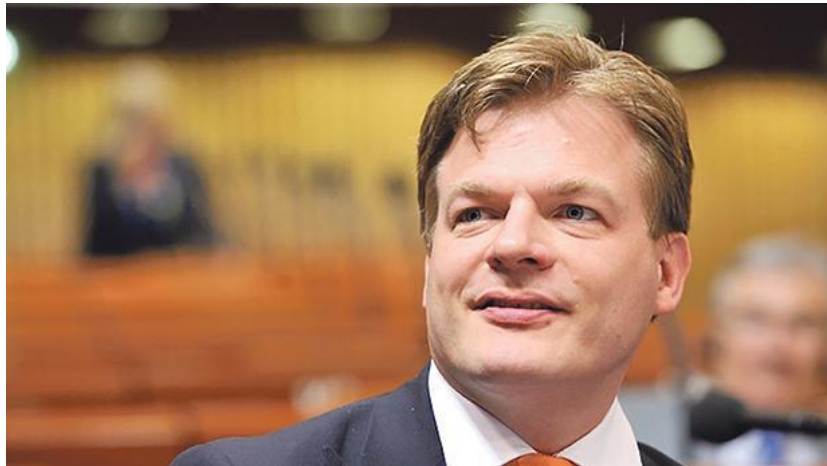
Pieter Omtzigt, Dutch MP and rapporteur in PACE on Poland

Pieter Omtzigt, Dutch Christian-Democrat MP and member of the Parliamentary Assembly of the Council of Europe (PACE), has been at the forefront of fighting for the rule of law in Europe for many years, from Azerbaijan to Poland.