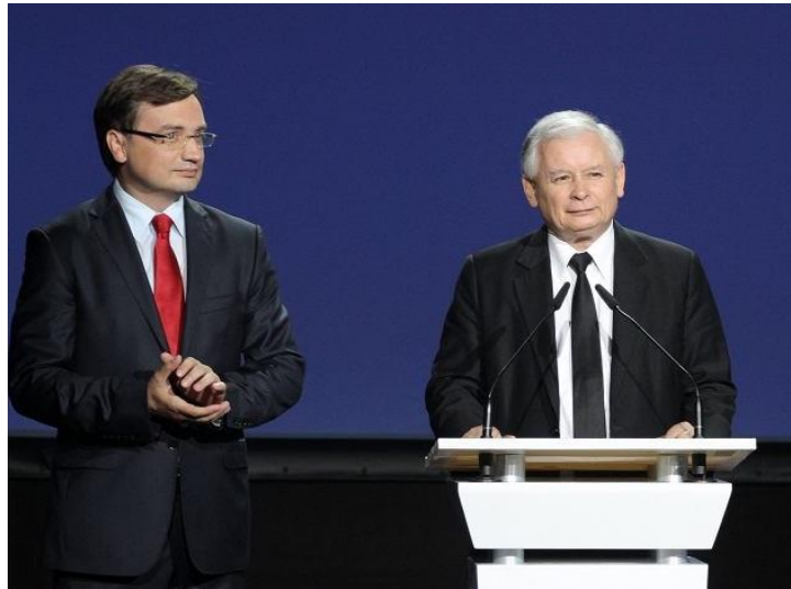
Minister of Justice Zbigniew Ziobro and PiS party president Jarosław Kaczyński

On 19 November 2019 the Court of Justice of the European Union (CJEU) issued a landmark ruling in response to a request from one chamber of the Polish Supreme Court (the Labour Chamber) for guidance on whether another, newly created, chamber of the Supreme Court (the Disciplinary Chamber), satisfied the requirements of judicial independence under EU law. The Disciplinary Chamber sits at the top of a disciplinary system for judges which the minister of justice controls and has already started to abuse. All its members have been selected by the reorganised National Council of the Judiciary, four fifths of whose members were appointed by PiS.