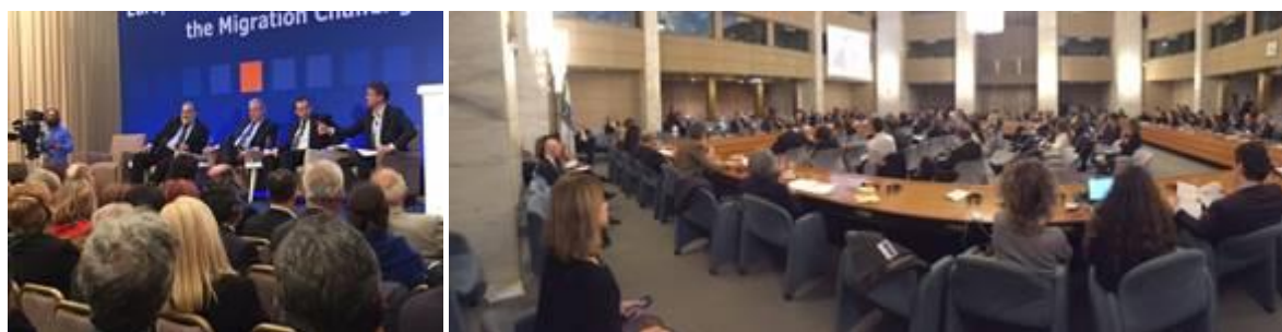
Presentation in Athens – Presentation in Rome