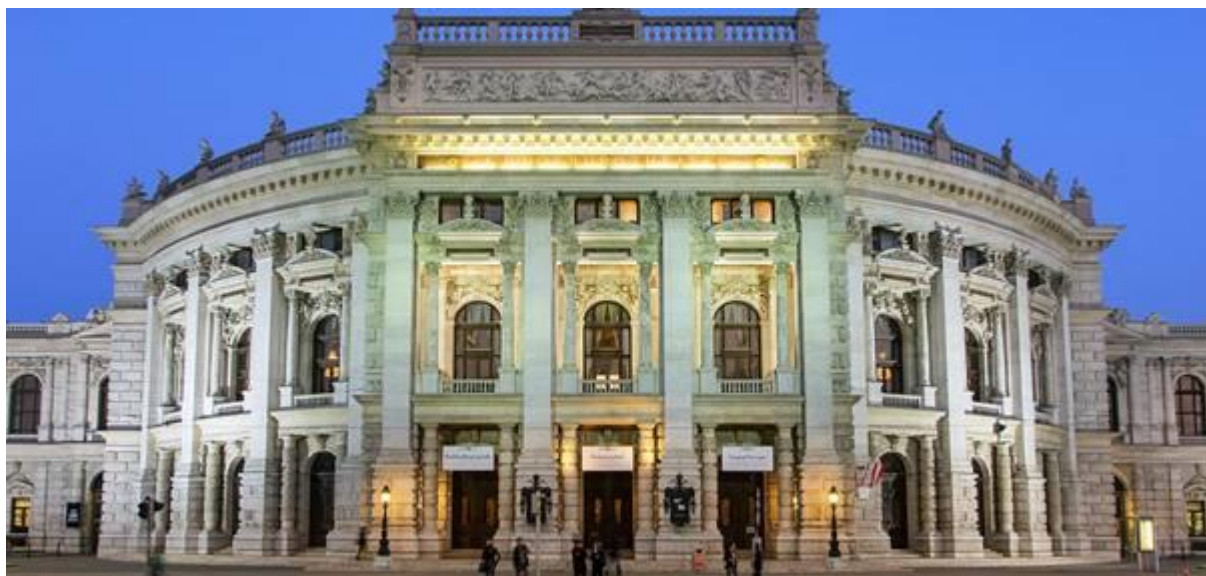
Burgtheater in Vienna

13 March, 11:00, panel debate at the Burgtheater - Debating Europe: Refugees in Europe. Yes, we can. But how? (in German language) with: