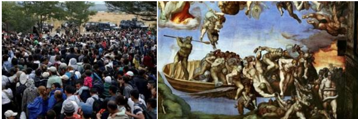
Inferno: Idomeni March 2016 – Michelangelo