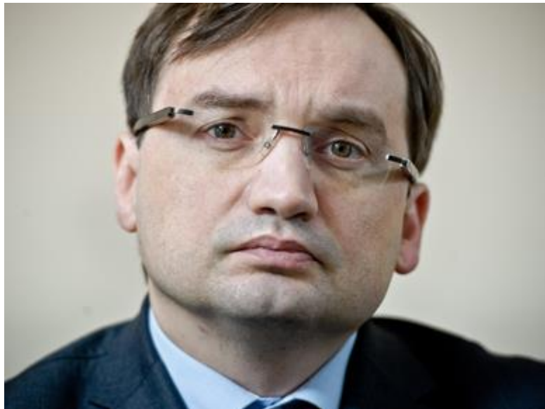
The future face of justice in Europe?

Zbigniew Ziobro was born in 1970. He studied law in Krakow. In 2001 he became one of the founders of the Law and Justice (PiS) party. In 2005 he became minister of justice for the first time. Since 2015 he has been a lead architect and the biggest beneficiary of his governments' "judicial reforms". As a result, he accumulated power like no other minister of justice in Europe: