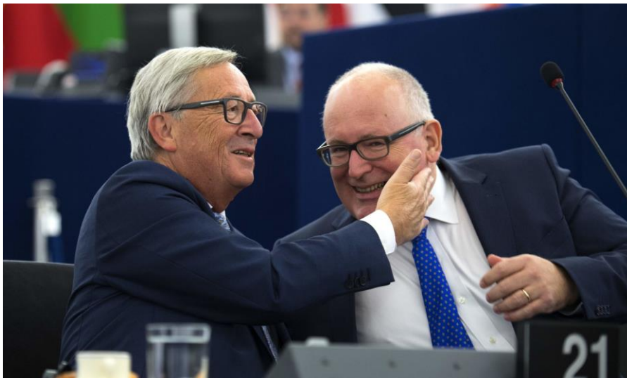
Going out with a bang and saving the rule of law? Juncker and Timmermans

Now that Commission vice president Frans Timmermans, who has played a key role dealing with Poland in the past four years, has entered the European parliamentary campaign as a leading candidate it is even more important that the battle to defend the rule of law is strongly backed by Commission president Jean-Claude Juncker.