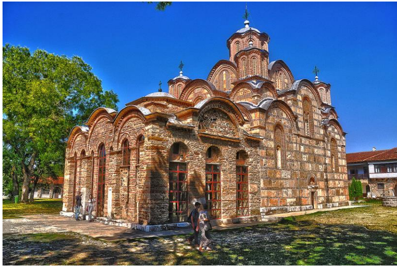
Gracanica monastery near Pristina

As Scott Adams writes in his book " Win Bigly ", master persuaders move the energy of debates to the topics that help them. The persuasion trick is to focus all debate on the issue of one's choice: "The things you think about the most, and remember best, seem more important to you than other things ... if you are using super strong persuasion, you can be wrong on the facts, and even the logic of your argument, and still win."