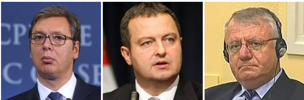
Aleksandar Vucic, Progressives – Ivica Dacic, Socialists – Vojislav Seselj, Radicals

Men of the 1990s and their three parties dominating Serbia in 2019