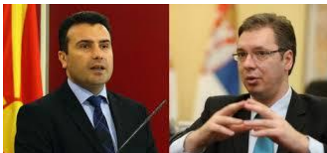
Regional leaders: Zaev and Vucic: who placed the right bet?

"And they will be told 'You are not joining the European Union anytime soon.' I tell you now that the EU will not allow them to open accession negotiations ... And everything these countries did will not be rewarded. People will see that it was not enough. This will further add to insecurity and instability across our region ... there will be a lot of dissatisfied people, disappointed by the unfulfilled promises of Europe."