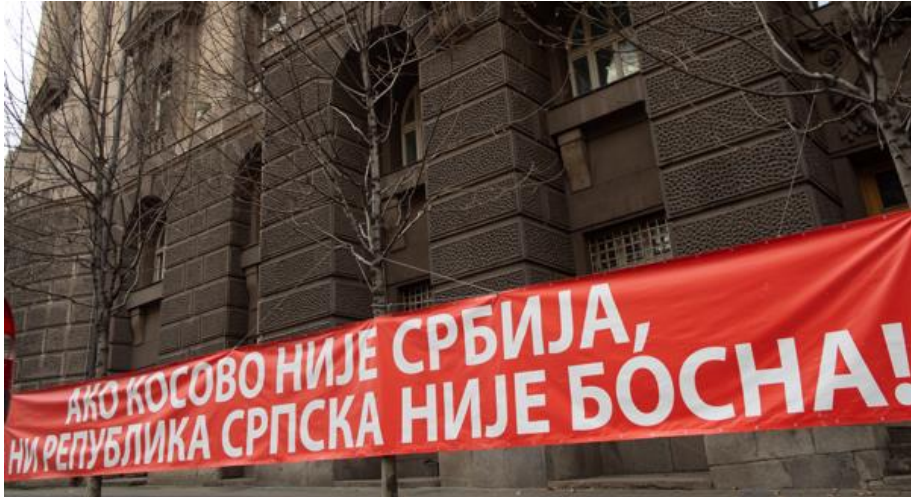
"If Kosovo is not Serbia then Republika Srpska is not Bosnia!" (in front of the Serbian Foreign Ministry)