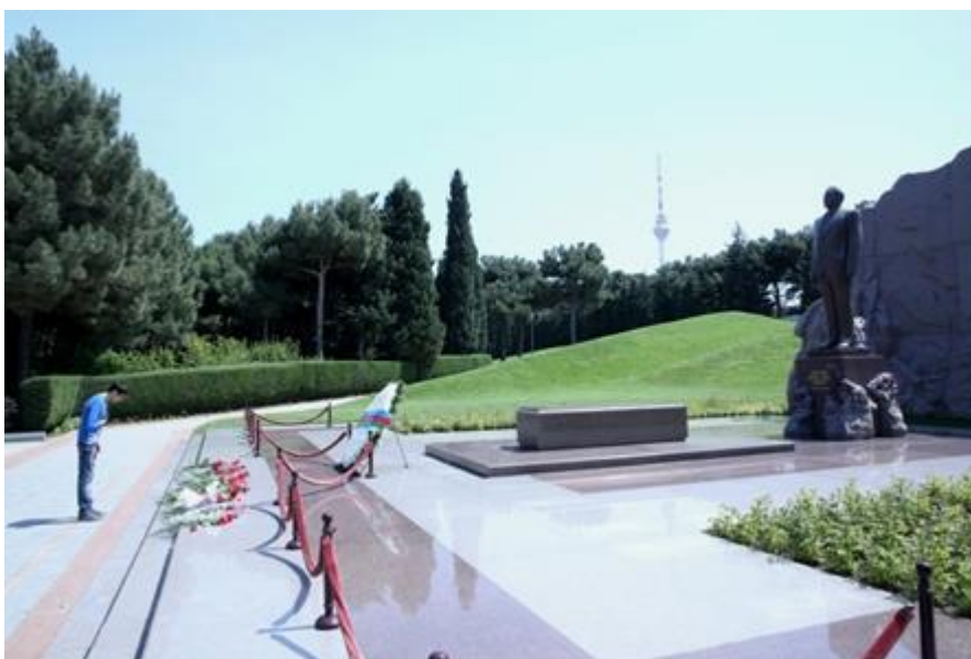
A released prisoner before the statue of the father of the Azerbaijani president

For somebody sentenced on drug charges these are curious things to write.