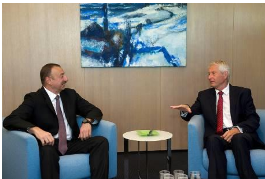
Ilham Aliyev and Thorbjorn Jagland in Strasbourg in June