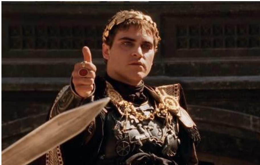
This Emperor is cruel but merciful