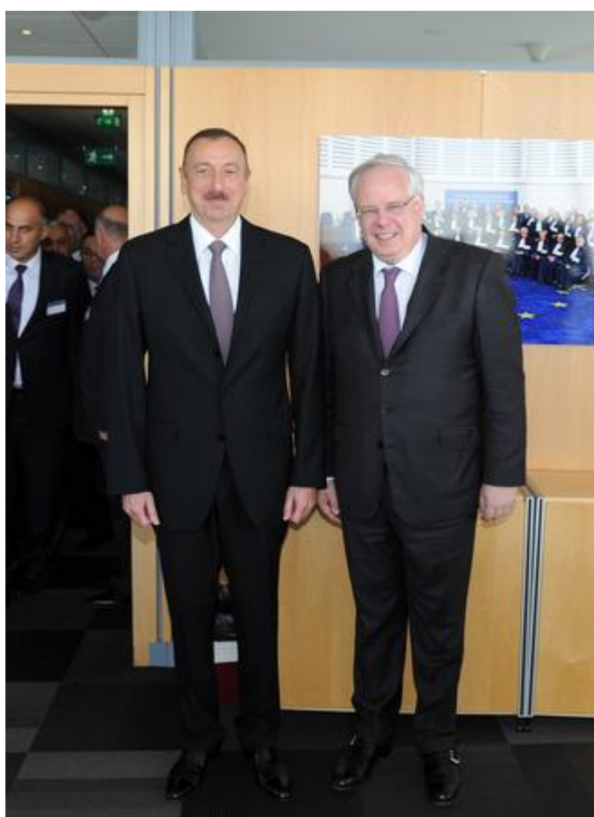
October 2014 – The President of Azerbaijan hosts the President of the European Court of Human Rights in Baku