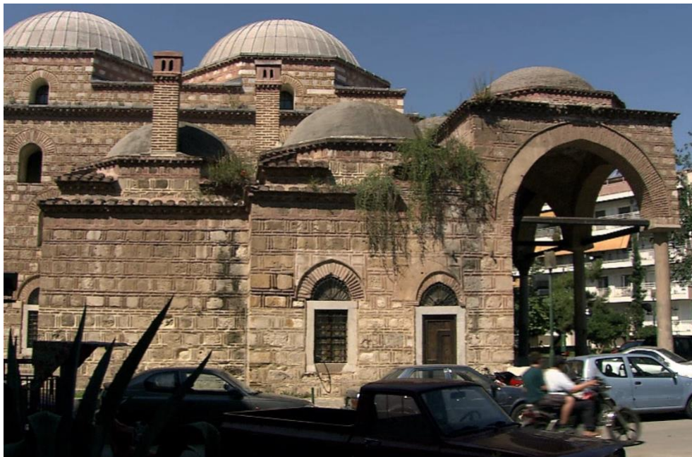
Hamam in Thessaloniki.

for the city. If he was elected mayor, he explained, he would want “citizens to love their city” by recovering an identity going beyond ancient glories and other nationalist tropes. Thessaloniki, in his view, deserved to be better governed: traffic was out of control, waste collection was a serious problem and there were persistent stories of corruption in the mayor’s office.