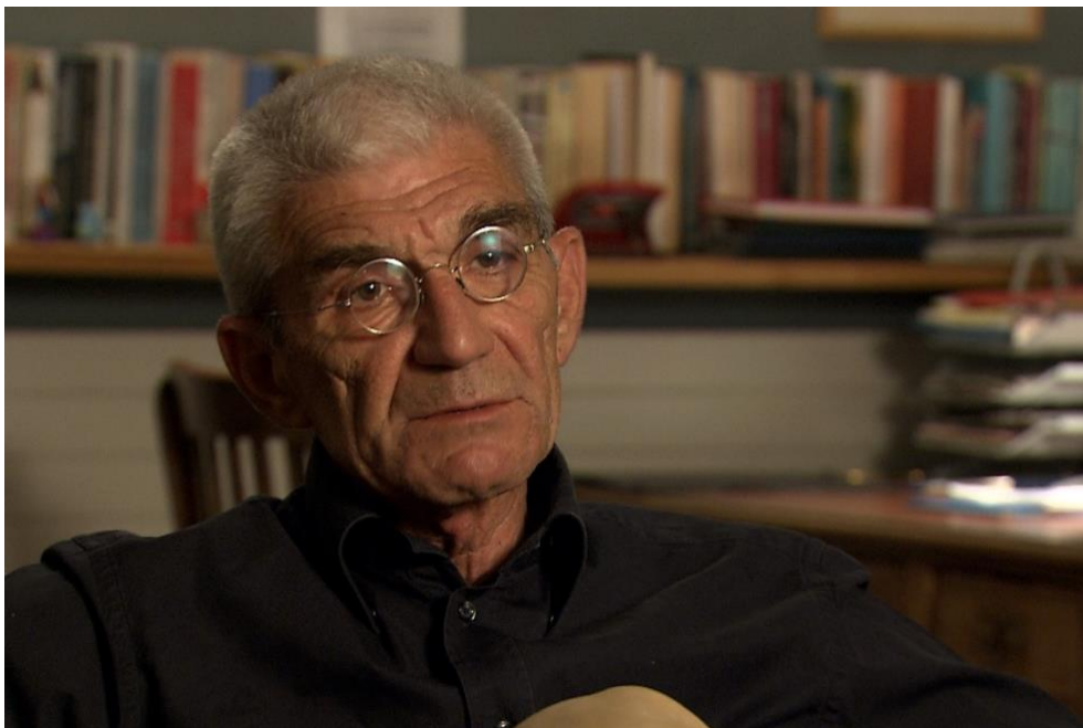
Yannis Boutaris.

The archbishop declared publicly that Yannis Boutaris “would never be mayor.” But the crisis of 2008 helped to propel Boutaris, a reformer who promised liberation from a conservative status quo, to a slender victory as mayor of Thessaloniki. Armed with a democratic mandate, he set out to realise his vision of an open city.