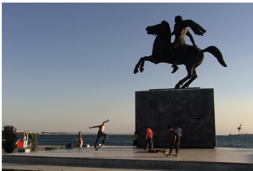
Thessaloniki's water front.

From the outset, Boutaris stressed that Thessaloniki must learn from other cities in Europe: Nice and Salamanca, Barcelona and Vienna, Hamburg and Berlin. He also stressed that he was a “pro-business social democrat.” He warned that “no entrepreneur, either big or small will invest in Greece when the badly organized and uncoordinated state asks you every day to prove that you are not an elephant.” He remains critical of the “demonization of business” by the state and the public. “In order to distribute wealth, you need to create favourable conditions in order to produce it,” Boutaris says. “And to focus on products that you understand and produce them at excellent quality.”