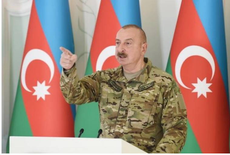
Ilham Aliyev, president of Azerbaijan