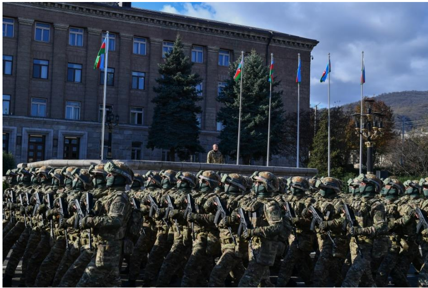
Ilham Aliyev attending a military parade in Hankendi/Stepanakert in Nagorno-Karabakh on 8 November 2023. Turan News Agency, “‘Azerbaijan does not need a new war’, Ilham Aliyev – Updated” , 8 November 2023.

However, those with a longer memory and an acquaintance with Aliev’s long-standing habit of clearly telegraphing his intentions will look back on a decade of repeated irredentist claims.